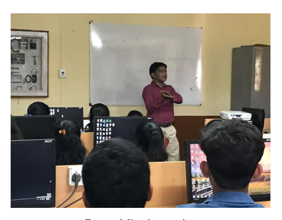
Expert delivering session

Approved by AICTE, Recognised by D.T.E & Affiliated to University of Mumbai Accredited by NAAC with 'B+' Grade