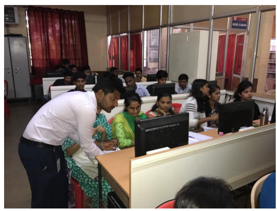
Expert guiding students during practical session